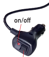
Pattern Selection Switch

- Press down selection switch for less than one second to go to the next flashing pattern .