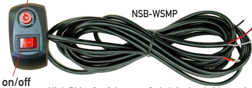
NightRider Gen2 Actuator Switch for hardwiring option.

- Press down selection switch for more than 5 seconds to reduce power output to 50%, press down for more than 5 seconds again to return to high power output.