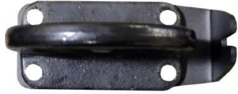
Passenger Side Toe Hook and NightRider Bracket Shown Here